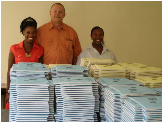
Our office and staff in SA preparing Teamwork Bible School materials for distribution to thousands of students across Africa

Conference: We still need preachers for the conferences in Nakuru, Kenya. July 31 - Aug 13 Sign up by April 15 For more information , email or call the office.