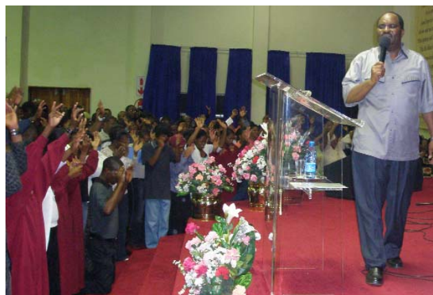
Empowering leaders in Soweto, South Africa and across Africa