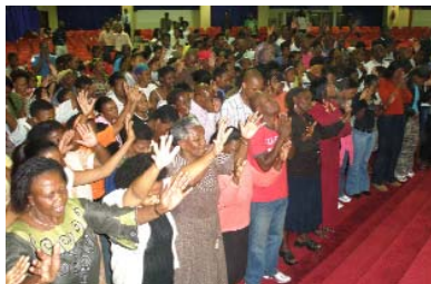
Activating leaders from South Africa and many parts of Africa

NON-PROFIT BULK RATE U.S. POSTAGE PAID MARTINSVILLE, VA PERMIT NO. 388