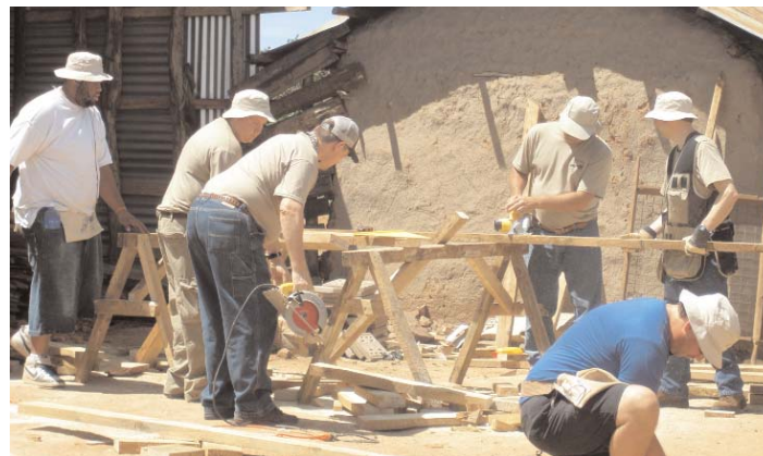
Team members built great comradarie as they worked together