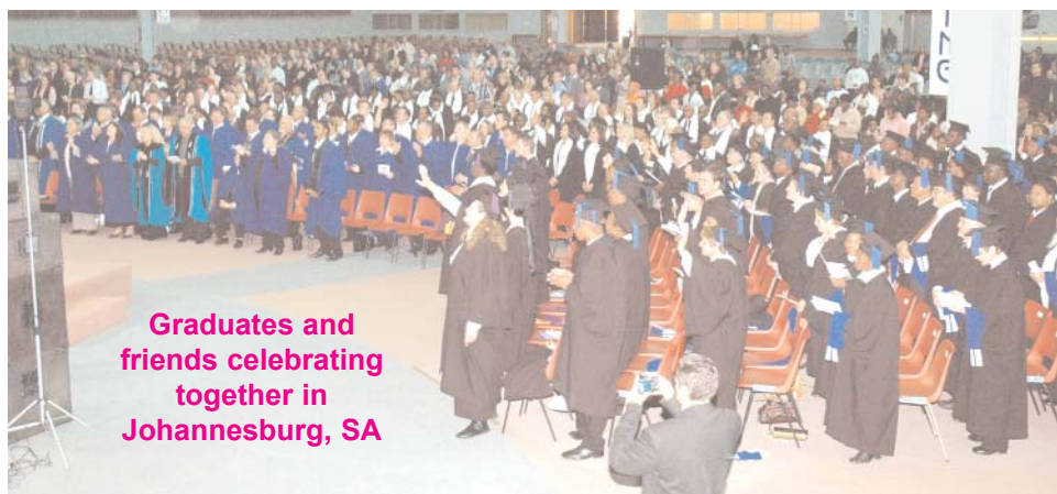
Graduates and friends celebrating together in Johannesburg, SA