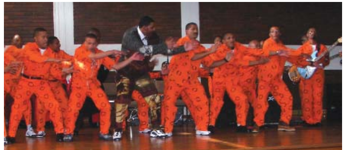
Inmates excitedly leading praise and worship during Teamwork Bible College graduation

Thank you too, to those of you who are standing with this ministry. Your support is making it possible for Teamwork to bring training in the Word of God to the underprivileged and the prisoners and to bring light to the nations.