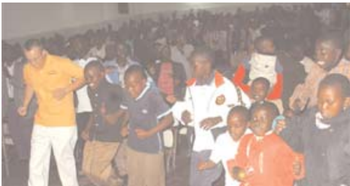
The children were excited participants in the evening services

The prophetic word over Kenya now is that the young men and women will be shot as flaming arrows across the world, bringing the gospel. One