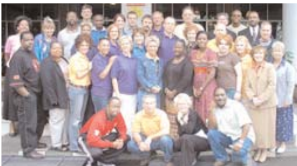
2004 Teamwork Kenya Mission Team

P.S. Don't miss the article in this newsletter about our incredible experiences in Kenya.