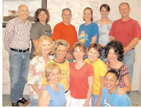
Children's Ministry Team