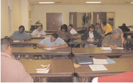
Love and Faith Bible College (an affiliate of TBCI)

Just as most children are heading back to school, many churches are starting up or reopening schools for training and equipping their people for ministry. Teamwork Bible College International can help you do just that.